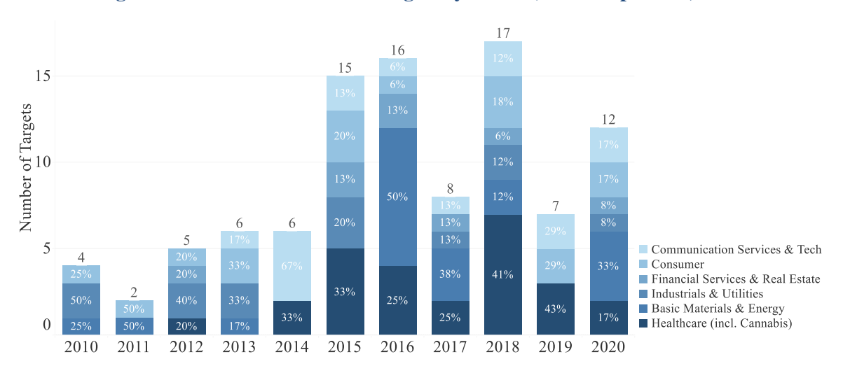
Figure 2 - Activist Short Seller Targets by Sector (2010 - Sept. 2020)<sup>43</sup>

For the small number of Canadian targets identified, annual Campaign activity appears to be highly cyclical as evidenced in Figure 1. In general, short sellers gravitate towards the securities of issuers and sectors where there is a perceived overvaluation (See Figure 2).<sup>41</sup> In peak Campaign years, this is evident as activist short sellers targeted Canadian issuers in specific, potentially overheated, sectors. For instance, in 2018 among a record 17 Canadian targets, approximately 35% (or 6 targets) were operating in the cannabis industry.<sup>42</sup> However, Campaign activity was largely muted in 2017 with 8 Canadian targets and in 2019 with only 7 Canadian targets. In 2020, there have been 12 new campaigns targeting Canadian issuers as of September 2020, however 4 of those Canadian issuers were also the target of activist short sellers in prior years.